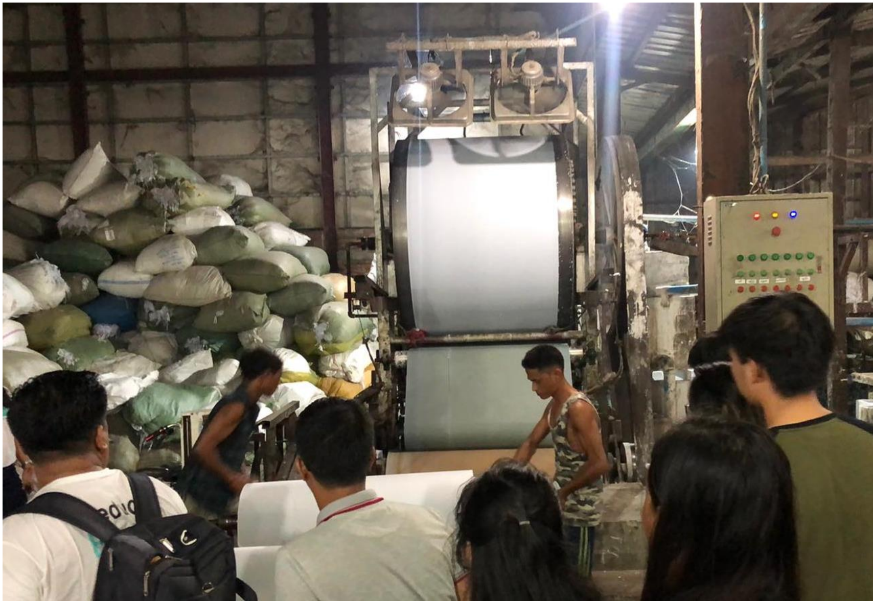
Left: Paper machine demonstration at the Paper Mill.

Charlie had the chocolate factory but we think our clients were able to see something even more magical. On the 14th November, our lucky team members and valued clients were able to take part in a visit to RecyGlo's recycling facilities for Paper, Glass, Plastic, and Organic waste. Segregating your waste and then having it picked up is one thing but have you ever wondered what happens to it afterwards? Some of our very lucky clients were able to see just that, a tour of the recycling facilities to see what happens after RecyGlo picks up your bins.