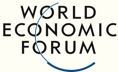
Asia : South East Asia

The market knows everything. The international and national markets are in a tightening situation and the business activities are shifting under inconsistent conditions. Moreover, the political movements have slowed down and climate change is not a priority anymore: the world's decision-makers have yet to include climate change in their decisions. The world health and environment security has been severely wounded by the COVID-19 pandemic. In the meantime, our challenge in the World Economic Forum's Innovative Challenge is one of the parts of May's achievements. Team RecyGlo has been shortlisted as finalist to the World Economic Forum challenge exposures. In the challenge context, our contributions and solutions for the challenge have a positive impact on climate change, circular economy waste management, waste to energy, and waste to fertilizer by handling innovative green technologies. No challenge, no change.