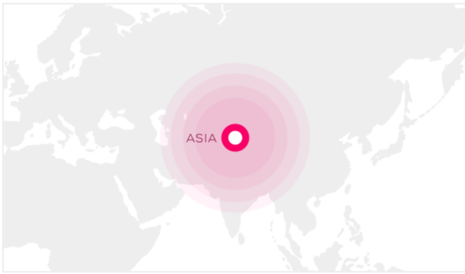
Asia : South East Asia

03 Our CEO, Shwe Yamin Oo was Shortlisted in the Women in IT Awards